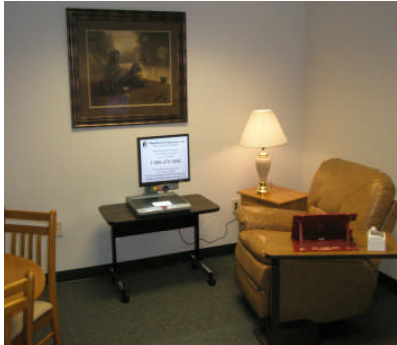
Our in-store living room

“I am only one, but still I am one. I cannot do everything, but still I can do something; and because I cannot do everything, I will not refuse to do something that I can do.” -Helen Keller