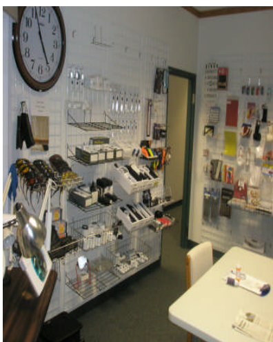
The store selection